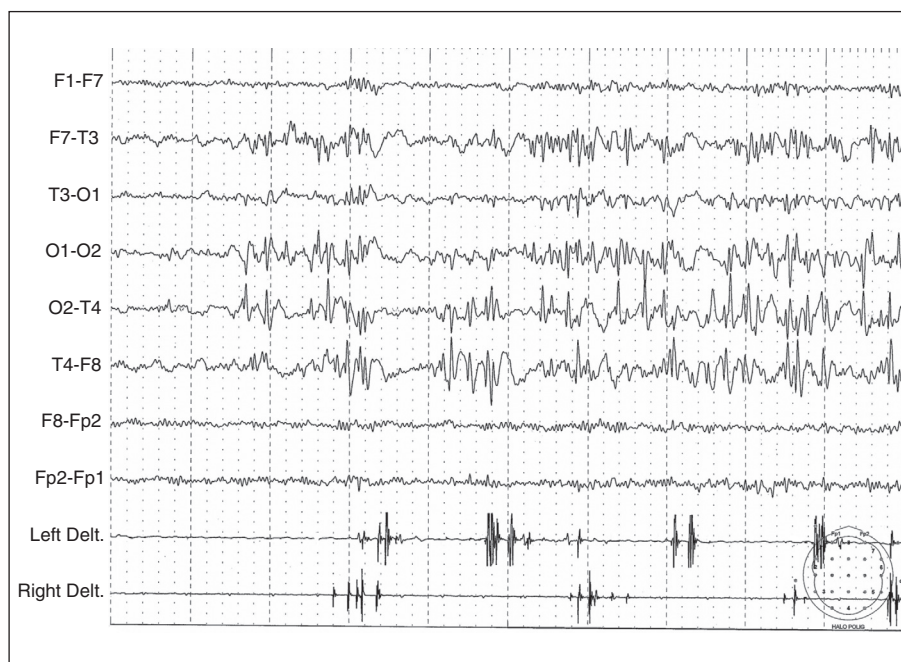
Figure 2. The polygraphic-EEG recording shows continuous, asymmetric and asynchronous bilateral spikes, and spikes and waves, associated with repetitive focal and, less frequently, bilateral myoclonias.

The myoclonic episodes were refractory to classic and new oral AEDs. The video-EEG showed continuous diffuse spike-and-wave paroxysms associated with subintractant multifocal and erratic myoclonias ( figure 2 ). The boy was admitted to the ICU because of refractory myoclonias, and intravenous levetiracetam, valproic acid, benzodiazepines, and corticosteroids were tried without response over three weeks before starting the KD. The KD was begun at a 4:1 ratio and glucose administration was discontinued, including that by intravenous infusion. After 24 hours of fasting, the child was given a commercial preparation (KetoCal