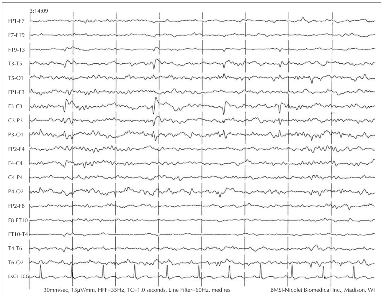
Figure 3. Interictal EEG in patient 2 shows left parieto-posterior temporal spikes during drowsiness.