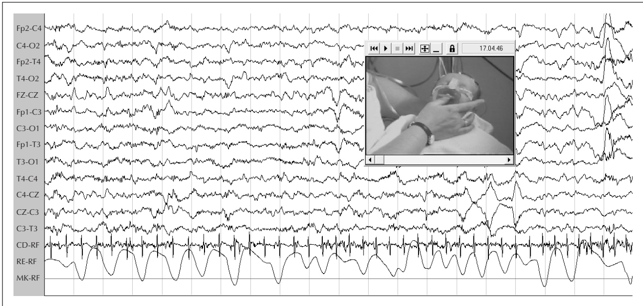
Figure 1. Interictal EEG: normal background activity in sleep state.

the 6 th day. On the 7 th day feeding difficulties arose and there were episodes of desaturation linked to bradycardia. A cardiological examination (ECG, bidimensional echocardiography) was performed with negative results. Episodes of desaturation persisted.